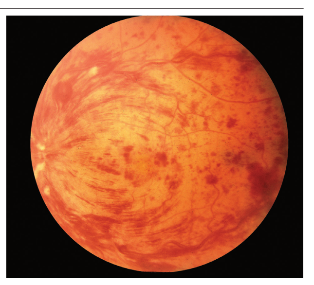
Figure 1 CRVO with Flame Hemorrhages

Common conditions that can take on an appearance of CRVO include diabetic retinopathy (retina disease) and retinopathy related to low blood counts, such as anemia and thrombocytopenia (a deficiency of blood platelets).